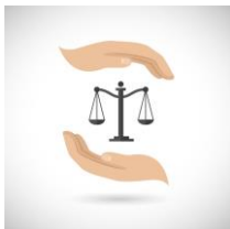
“Crime doesn’t pay”

Then, the students are divided in small groups (between 3 and 5 people). The teacher hands out a copy of each card to each group. Here are some examples of cards which can be downloaded on the website (for each card, there is a description of the theme which can help the teacher to prepare the discussion):