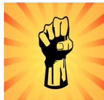
“The Individual vs. society”